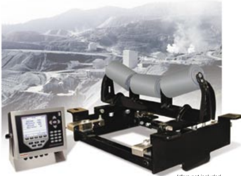
Idlers not included.